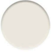
Alabaster Sherwin Williams