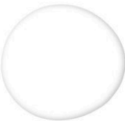
Extra White Sherwin Williams