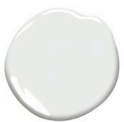
Decorators White Benjamin Moore