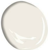
White Dove Benjamin Moore