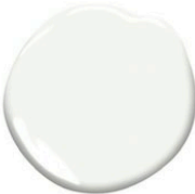
Chantilly Lace Benjamin Moore