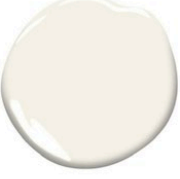
Simply White Benjamin Moore