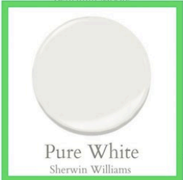
Pure White Sherwin Williams