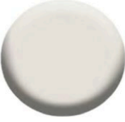
Heron Plume Sherwin Williams