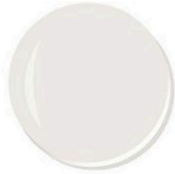
Snowbound Sherwin Williams