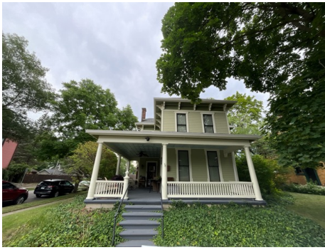
North Side of Home