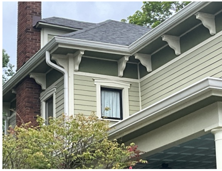
North Side of Home