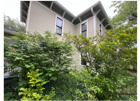
West Side of Home