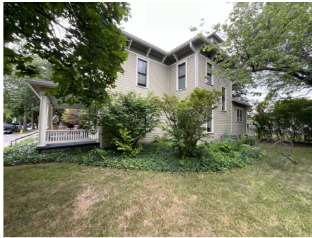
West Side of Home