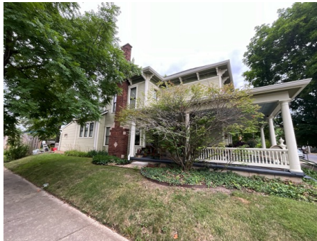
East Side of Home

Bondo filler repair on trim in corner of dormer