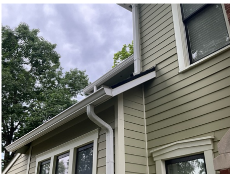
East Side of Home