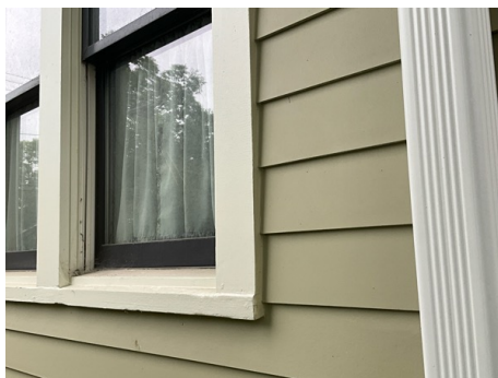
East Side of Home

All edges of window trim, band board, and corner trim to be painted siding color (Koi Pond) on all surfaces where