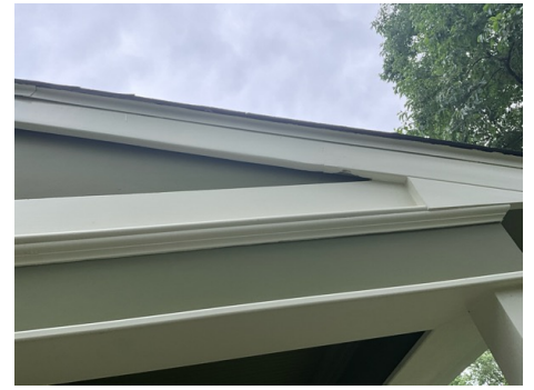
Railings and Gutter...