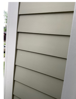
East Side of Home

All edges of window trim, band board, and corner trim to be painted siding color (Koi Pond) on all surfaces where