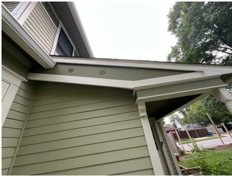
Railings and Gutter...