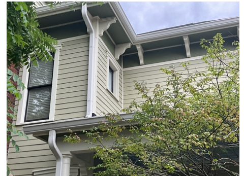
East Side of Home