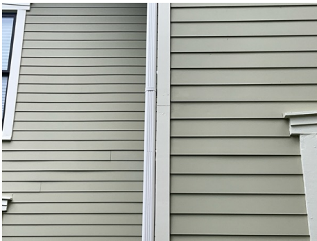
West Side of Home

CertaPro to caulk all gaps where wooden surfaces come together