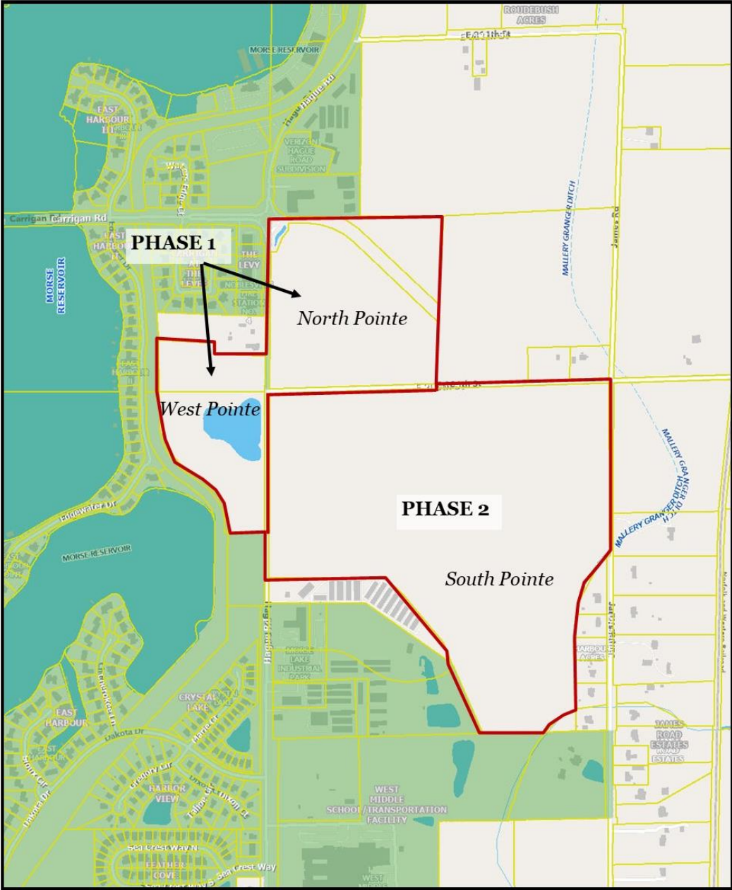
EXHIBIT 3 Annexation Phasing Plan