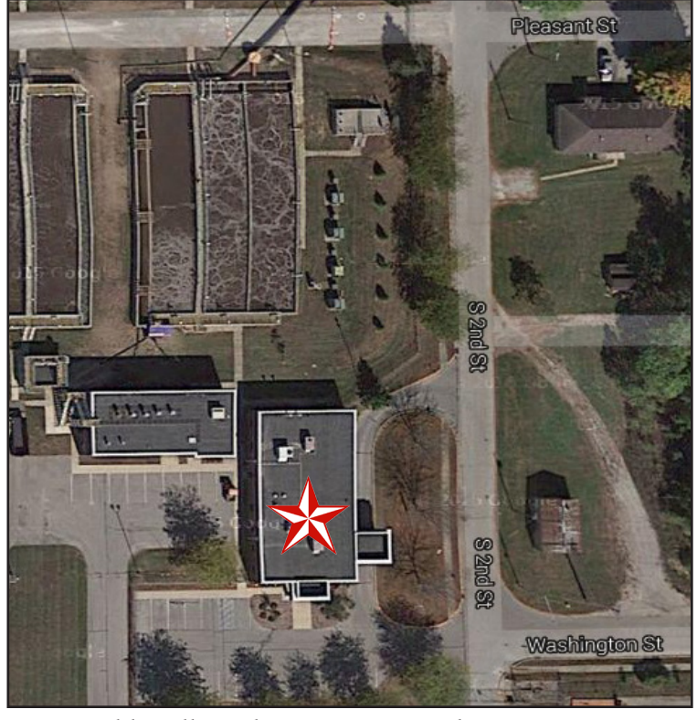
Noblesville Utilities, 197 W. Washington Street