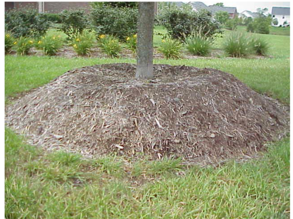
Poor Mulching Technique