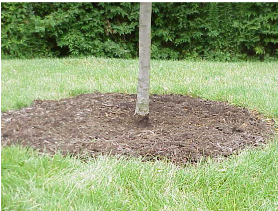
Correct Mulching Technique

Thoroughly cover the area to a uniform depth to be most effective. Low or bare spots are prone to weed problems and uneven mulch does not properly insulate the soil.