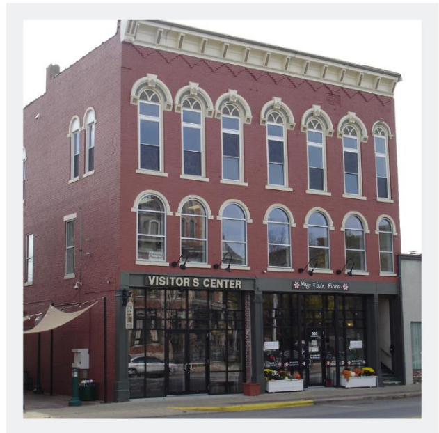
Façade Improvement at 839 Conner Street