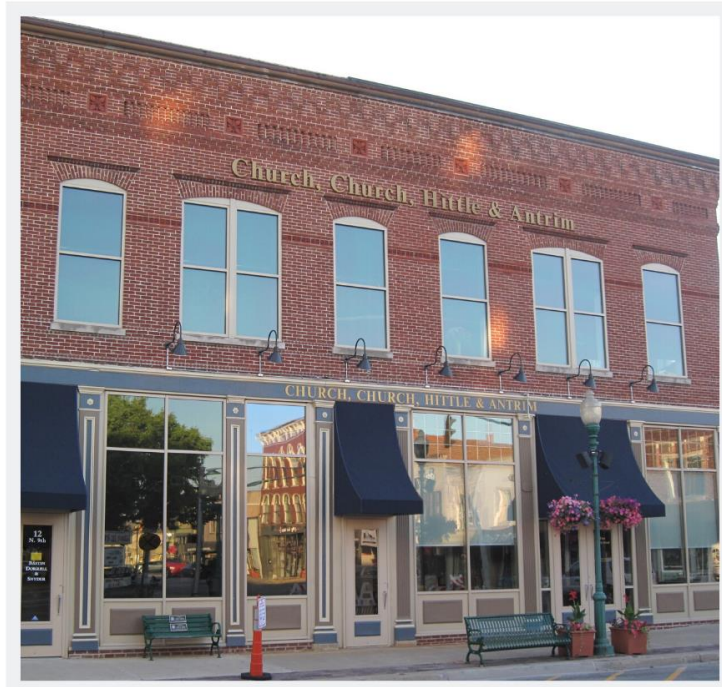
Façade Improvement at 2 N. 9th Street