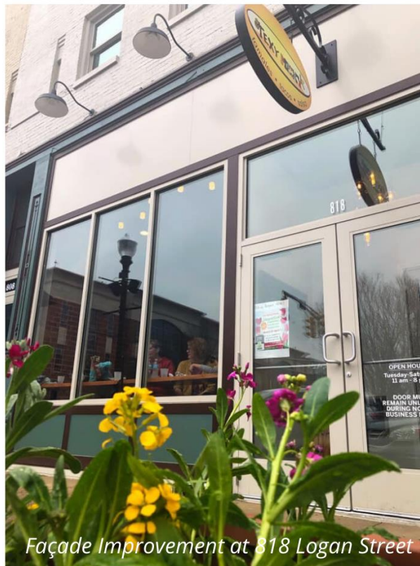
Façade Improvement at 818 Logan Street