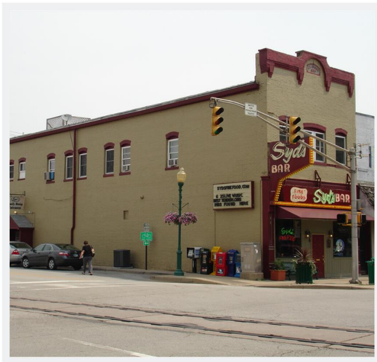
Façade Improvement at 808 Logan Street